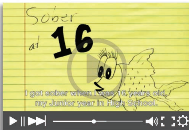
From the Young People’s Animation video available on aa.org .